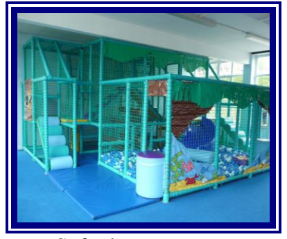
Soft play room